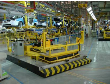
Automated Guided Vehicle (AGV) on the job in chassis and underbody assembly at GM in China, supplied with power by an IPT® Floor System.