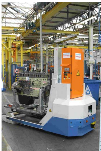
Motor assembly at DAF, automated transporters supplied with power by an IPT® Floor System