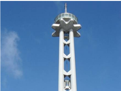
The Hannover Expo fair ground uses an IPT® Rail System to operate the elevators in the Hermes Tower.