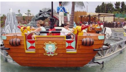
At Legoland in California, the water ride "Pirates Splash Battle" runs on an IPT® Rail.